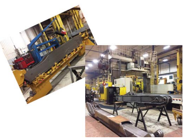
Boom & Stick Production