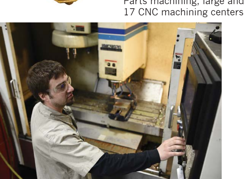
Tool, jig and fixture design and manufacturing