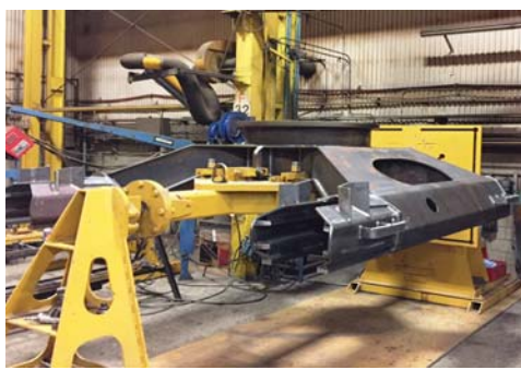
Car Body Undercarriage production