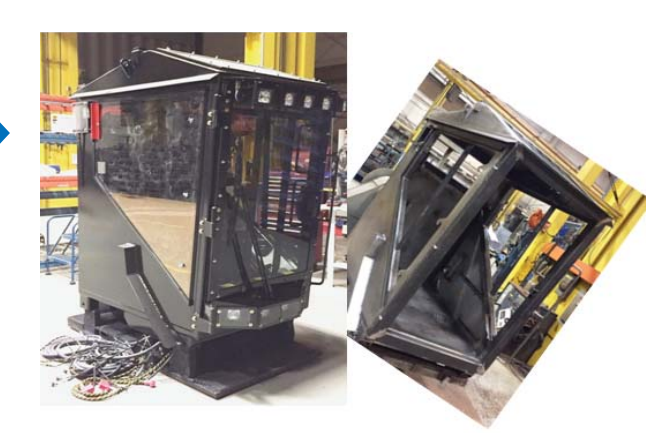
Operator Cab production