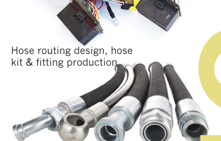
design and build