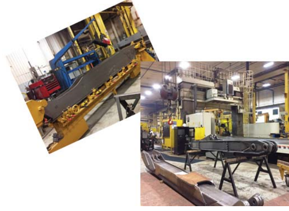
Boom & Stick Production